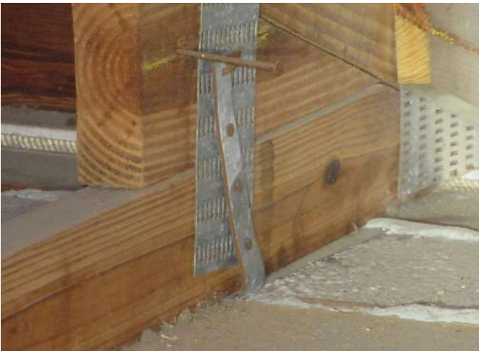
Single strap with at least 3 nails into the truss