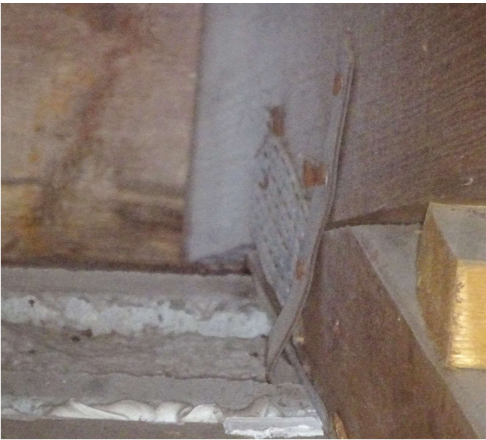
Single strap with at least 3 nails into the truss