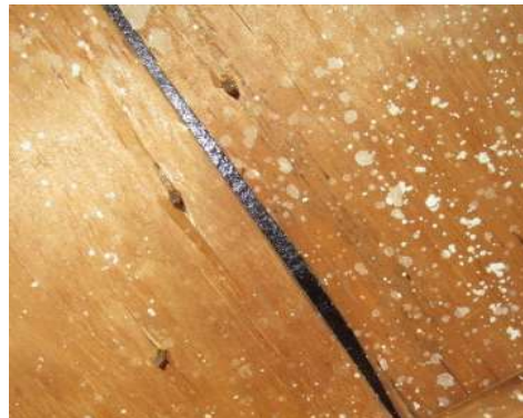
SWR installed under covering