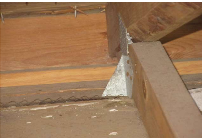
Clip with at least 3 nails into the truss