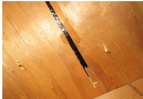
SWR installed under covering