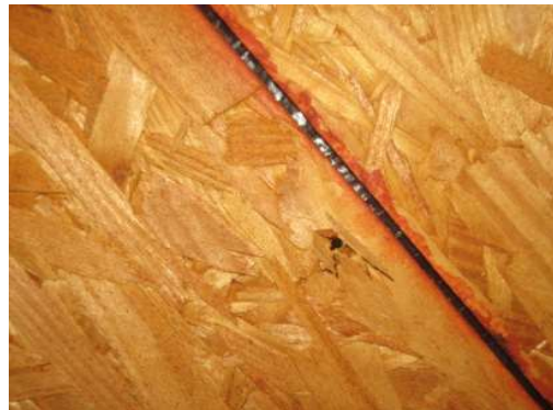
SWR installed under covering