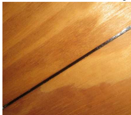
SWR installed under covering