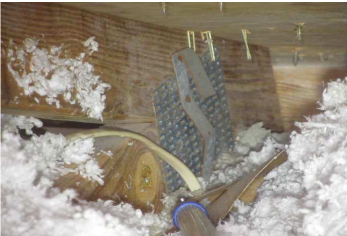
Single strap with 2 nails into the truss