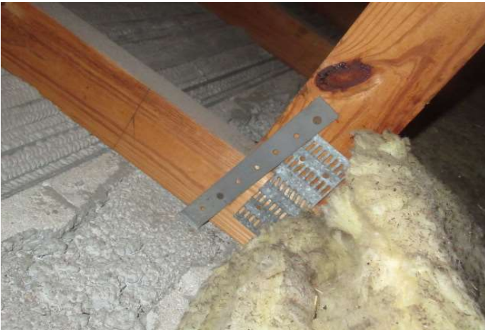
Single strap with 2 nails into the truss