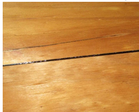
SWR installed under covering