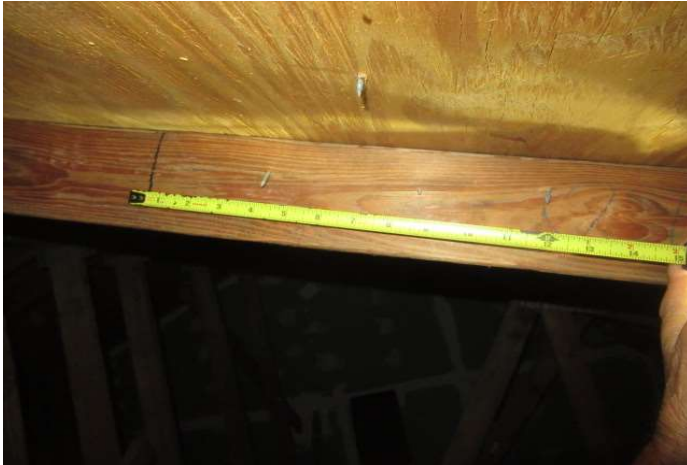
6" spacing in the field