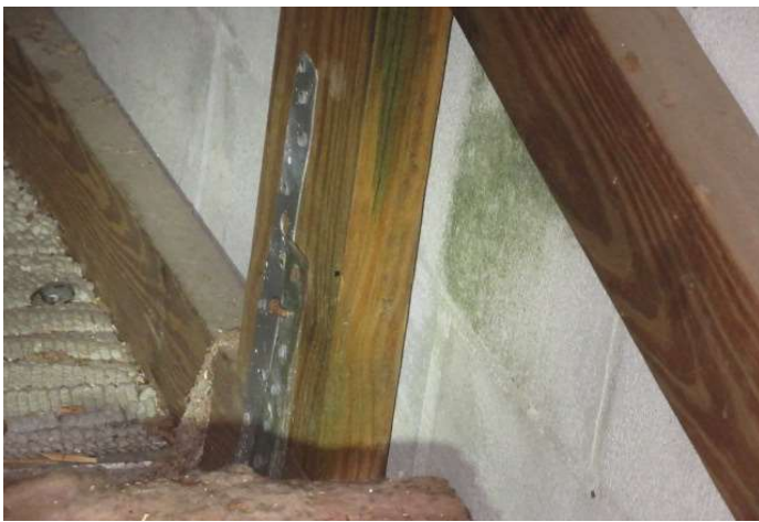
Single strap with at least 3 nails into the truss